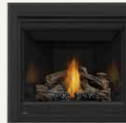
Black 3" Premium Bevelled Trim Kit shown with MIRRO-FLAME™ Porcelain Reflective Radiant Panels