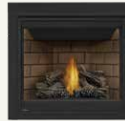
Black 2" Trim Kit shown with Sandstone Brick Panels