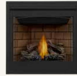
Zen Decorative Safety Barrier shown with Sandstone Brick Panels