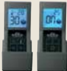
F45 & F60 Remote Controls On/off with digital screen