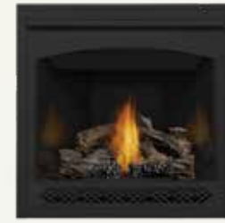
Heritage Decorative Safety Barrier shown with MIRRO-FLAME™ Porcelain Reflective Radiant Panels