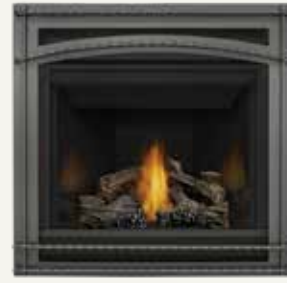
Wrought Iron Surround shown with MIRRO-FLAME™ Porcelain Reflective Radiant Panels