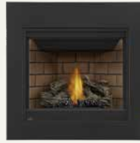
Matte Black Clean Face Surround shown with Sandstone Brick Panels