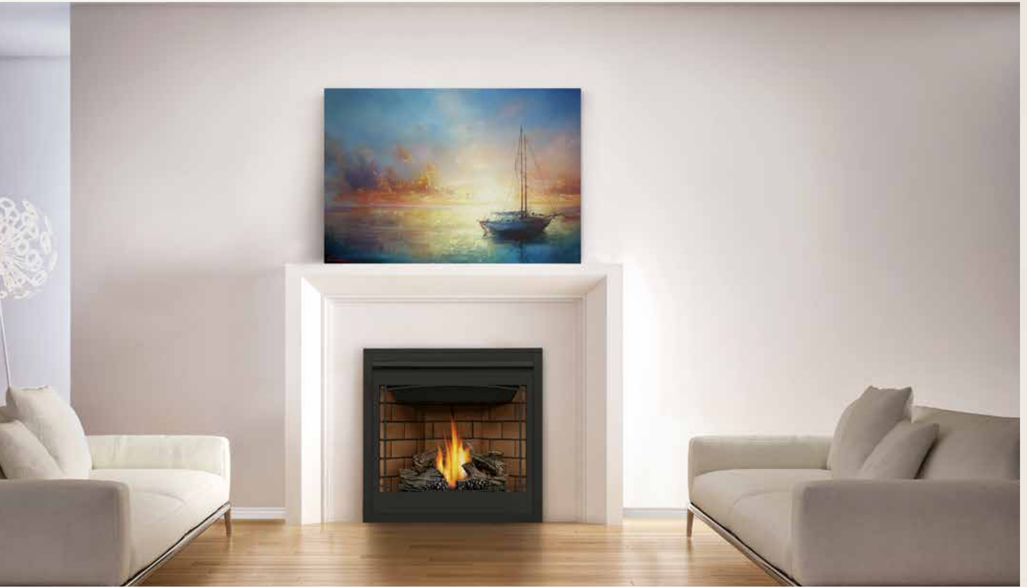
The Ascent ™ 35 shown with Sandard Safety Barrier and Sandstone Decorative Brick Panels.